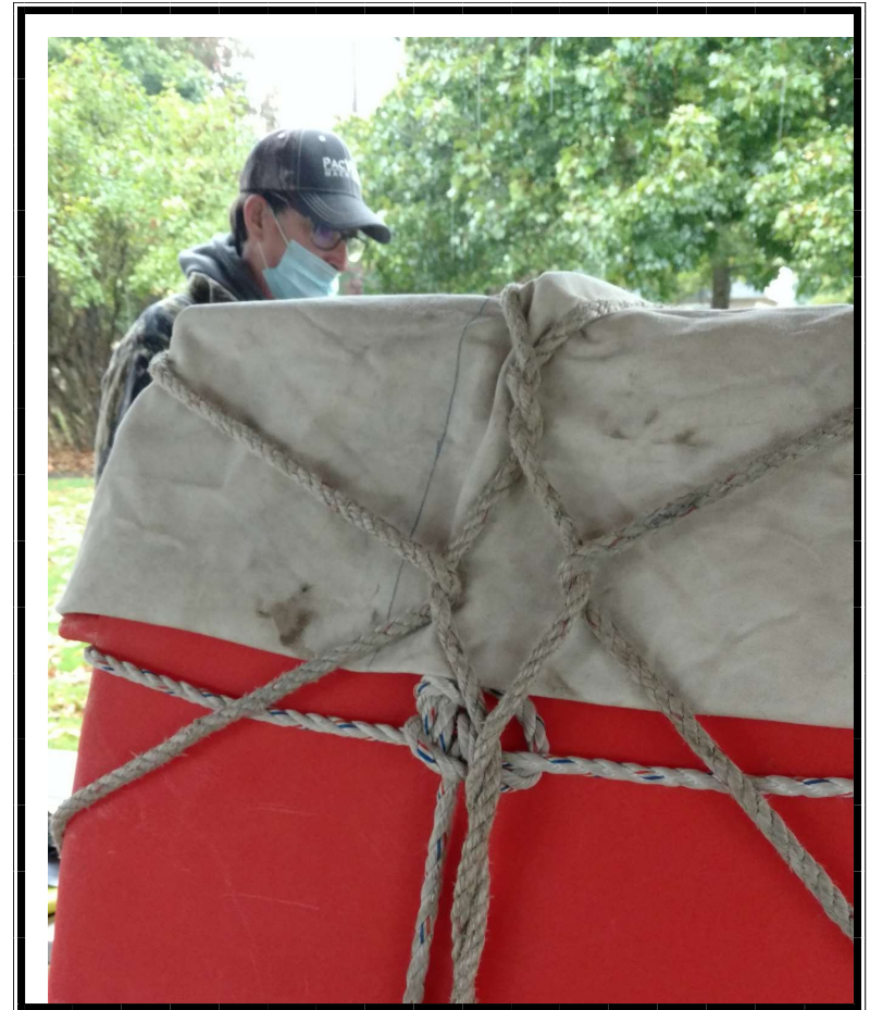
Diamond hitch demonstrated at last month's packing clinic.