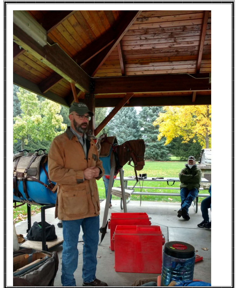
The Trailmeister put on a packing clinic in October that was attended by some 20 people. It was held at the Dalton Garden City Hall Park.